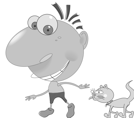
Figure This! Math Challenges for Families

What can I do to help my child get the most out of math?