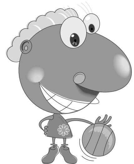
Figure This! Math Challenges for Families

How can I work with the school to make sure my child gets the most out of math?